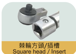
棘輪方頭/插槽 Square head / Insert