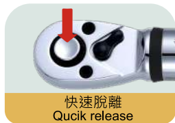
快速脫離 Quick release