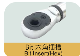
Bit 六角插槽 Bit Insert(Hex)