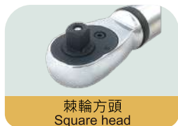
棘輪方頭 Square head