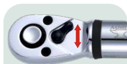
棘輪切換 Reversible ratchet