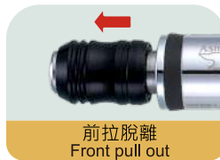
前拉脫離 Front pull out