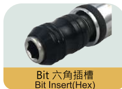
Bit 六角插槽 Bit Insert(Hex)