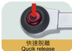
快速脫離 Quick release