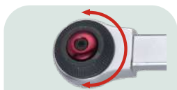
棘輪切換 Reversible ratchet