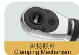
夾持設計 Clamping Mechanism