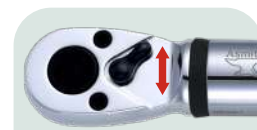
棘輪切換 Reversible ratchet