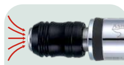
強磁吸附 Magnetic adsorption